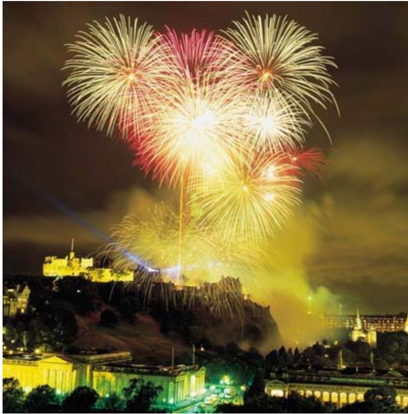
Edinburgh Hogmanay 2005

Hogmanay is the one night of the Year when everyone wants to experience the Scottish taking part in celebrating the world famous New Year that still involves the singing of centuries old words of Robbie Burns in the rendition of Auld Lang Syne.