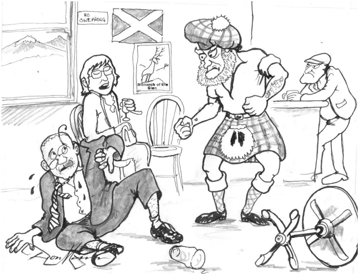
Example of a Scotsman Stereotype

How can we encourage a wider perspective, avoiding the stereotype of Scottish culture while retaining its integrity – or is cultural tourism all about the traditional stereotype? Does the tourist only ever find a ‘package’ bearing little resemblance to what Scots themselves would think of as realistic?