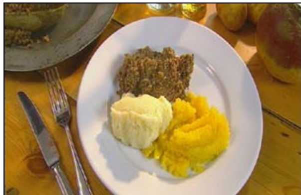
Haggis, Neeps and Tatties