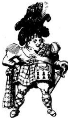
King George IV 1822 An unpopular king

Kilts and Tartans before the visit form the Monarch were no longer in ordinary Highland wear let alone formal wear; they were only commonly used for Army uniforms created due to the Jacobite rising. The Booklet produced by Sir Walter Scott to give advice on the Royal visit, warned that “no gentleman is to be allowed to appear in any thing but the ancient Highland costume”. This statement all gentlemen without highland dress (lowland gentlemen) had to search no matter how distant or remote for Highland Ancestry to then gain a suitable tartan. The Kings one time kilted appearance in Scotland was not a total success for the King was characterised as “our fat friend” that needed to be hoisted on to a horse. The short kilt with which we are most familiar today, was introduced at this time and in effect was produced as a tourist version of Scots culture.