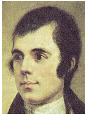
Robert Burns's Scottish Poet

One of the objectives of the Worldwide Burns Club is, among other things, to promote students to... 'study Scottish literature, history, art, music and language'. The Robert Burns Club of Milwaukee claims to have the most complete Web-site dedicated to Burns, which includes the complete works of Burns, indexed by title, first line, genre, biography, glossary of 2,000 words of Scots dialect and all the words in Burns poems, listed alphabetically and linked to the poems in which they appear. It sometimes seems that Scots overseas are more Scottish than their kinfolk 'back in the old country' and happy to participate in their heritage whenever the opportunity presents!