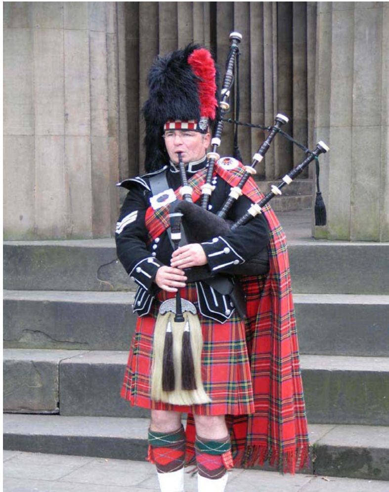
In full formal highland dress and playing the bagpipes

However this did create a new Scottish National Identity uniting Highlander and Lowlander by having them both in the iconic symbolism of kilts and tartan?