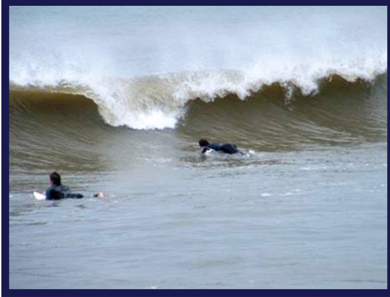
Surfing at Aberafan Beach

(See appendix 5 for a case study on Aberafan Beach and its refurbishment)