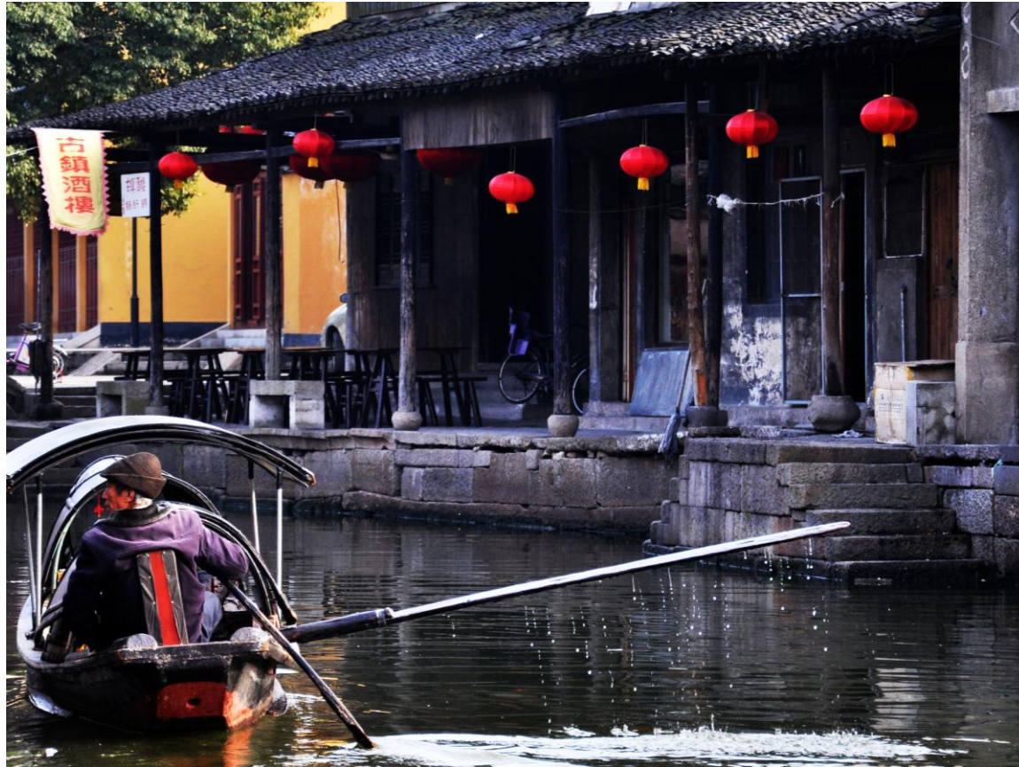
A black awning boat in Anchang County, Shaoxing, Zhejiang province. The town has ancient buildings and a history of boat travel. Biying Li

This image asks the viewer to look at many elements and raises questions. For example, is that a café we are looking at? The red lanterns provide a nice “pop” of color.