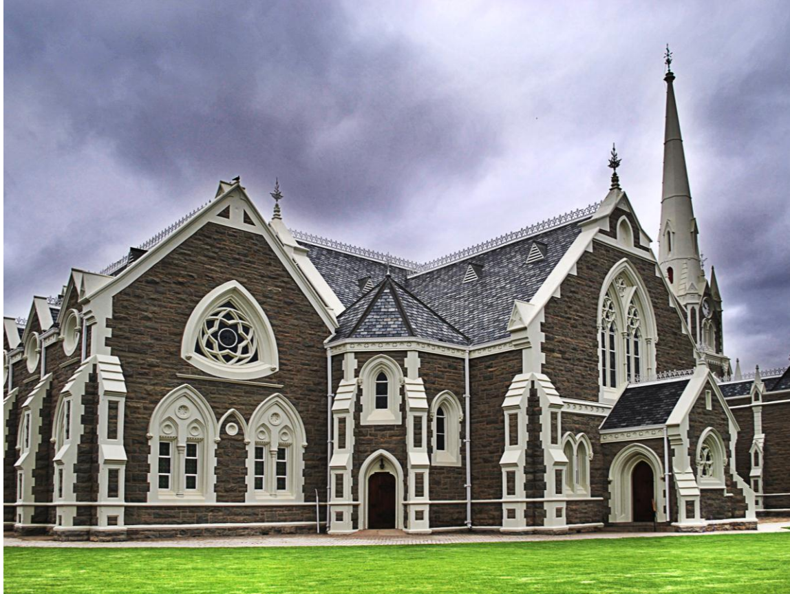
Grotekerk (an Afrikaans word meaning "High Church") in Graaff Reinet, Northern Cape. Zander Visser

Interesting treatment of the sky! The stormy gray clouds and flight lighting almost transform this structure into a sculpture. This shows how light can change an image.