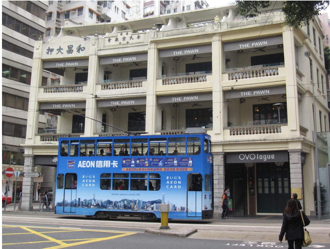
Hong Kong, China, Heritage Building & Tram. Tse Ka Ming

A good reminder of why a photographer needs to keep a camera handy and eyes open for an excellent visual opportunity, especially when one of the two main visual elements is in motion. The photographer clearly has a good eye. The two rectangular blocks, one blue, one grey are interesting but the picture does not exploit the graphic opportunity. Time permitting, waiting for the next tram to arrive would have given the photographer a chance to experiment with different camera angles.