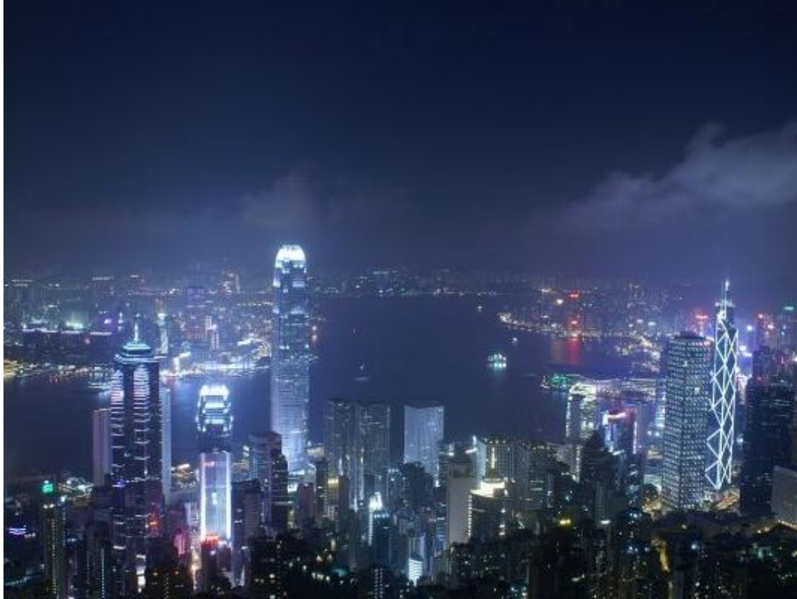
View of Victoria Harbour and Hong Kong from the Peak at night, Hong Kong, China. Lam Siu Ying

The photographer realized that bad weather and nighttime lighting make a brooding and interesting image when combined with the spectacular aerial viewpoint of Hong Kong.