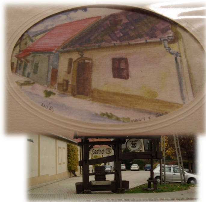
Wooden press in service of a restaurant

The Swabian families settled in Mór and in its vicinity in the 17 th and 18 th century brought their own viticulture and typical press-house building style. This style can be characterised by a press-house with a large decorated door and two windows built symmetrically on the sides. In the press-house there is a room for relaxing