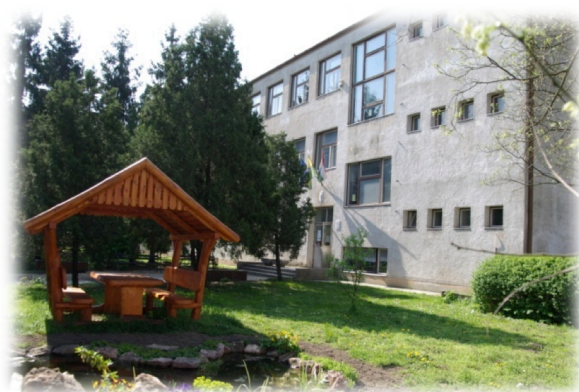
The school buliding

Our School is named after Mihály Táncsics who was