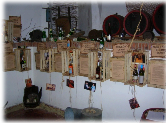
Exhibition about local wines in the Lamberg Palace (cultural centre)