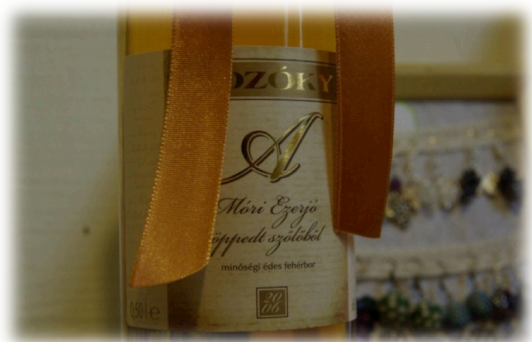
The „aszú” quality thousandgood wine

One of the smallest historic wine regions of Hungary is the Mór Wine Region. Mór is known for one indigenous variety, called Ezerjő, which makes a dry white wine with high acidity. Ezerjő is not well known elsewhere, mainly because its true character can only develop in the climate of the Mór